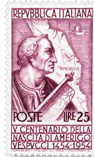
SC no. 665

In the year 1954, the Italian postal administration issued two stamps of identical design in commemoration of the 500th anniversary of the birth of native son Amerigo Vespucci, the navigator after whom the continents of the Western Hemisphere were named. The portrait showing him with a partially unrolled chart may be a copy of the original painting from life which has been attributed to Angel Bronzino, or of one of the several copies known to have been taken from it. The background consist of a portion of the world map published by Martin Waldseemüller at St-Die in Lorraine in 1507, a map in which the components of the New World are represented by two long and rather narrow island continents. The parts reproduced in the design extend from the coasts of Venezuela to southern Patagonia and only vaguely reflect the shape of the eastern shoreline of the southern continent. The only identifying designation Waldseemüller applied to them in the map proper was TOTA ISTA PROVINCIA INVENTA EST PER MANDATUM REGIS CASTELLE . The word AMERICA was inserted by the designer.