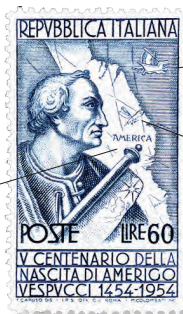
SC no. 666